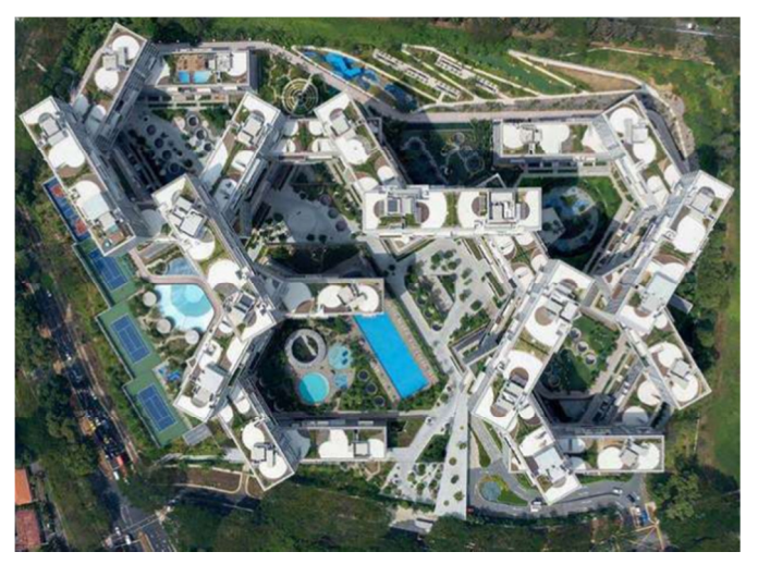
Fig. 4. The principle of landscaping a residential area in Singapore (top view)

functioning of cities, improving their architecttural and artistic appearance, quality and comfort of life.