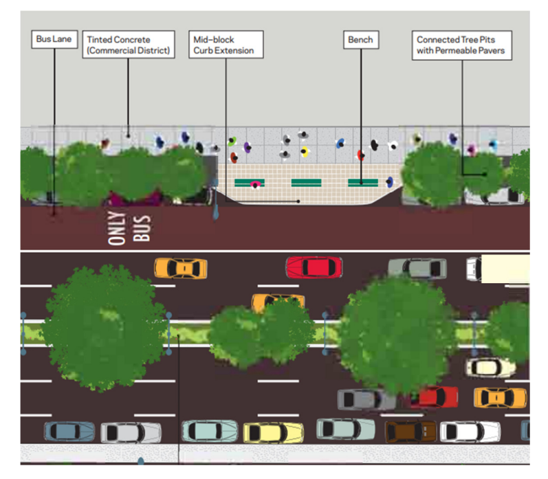
Fig. 3. Typical scheme of main streets in accordance with the standard New York City Street Design Manual

Canada. The principles and approaches to city development and the improvement of street and public spaces are set out in many documents and regulations. The main document is the Toronto Official Plan, adopted in 2010. The plan addresses the problems of city development, taking into account the integration of new development into existing infrastructure, and ensures the protection of streetscapes and plantings [16].