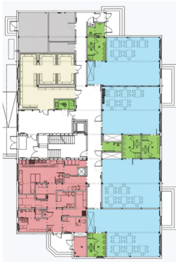
Fig. 3. Design of a prefabricated kindergarten

Thanks to the flexibility in the choice of components, it is easy to adapt any design to the needs of the student community. The size of the building or rooms can be simply and easily reduced or increased, and the layout can be changed at will [17]. Such design becomes easy, as issues of technological requirements in the field of structural engineering are preserved during the production of standardised modules. The aforementioned participation of primary school pupils was made all the easier by the fact that pupils were even able to easily propose the layout and shape of their school building themselves, which would suit their needs.