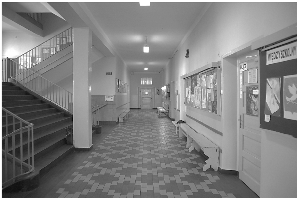
Fig. 2. Relatively not too large and narrow corridor spaces.