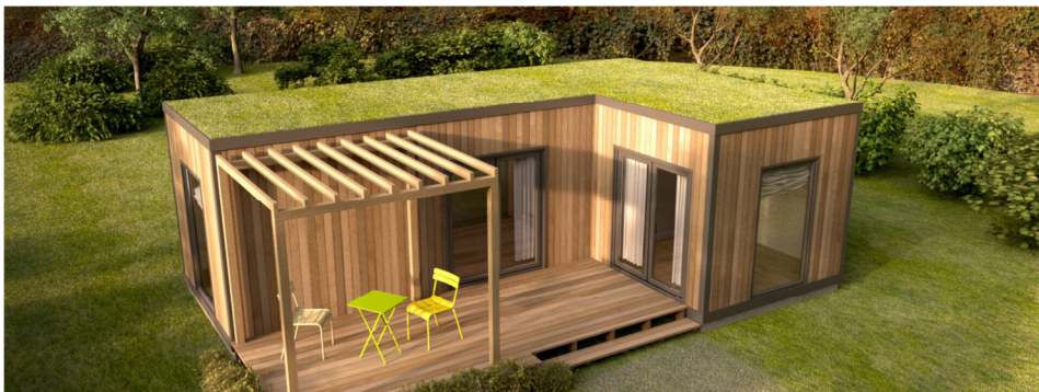
Fig. 4. Example of a modular recreational building.

Due to the different construction technique, there are also other complications. Heavy equipment is required to erect a modular building. A heavy-duty crane is required; one 35 m 2 module can weigh between 11 and 14 tonnes. Suitable conditions must be provided for the access and positioning of such a crane. In addition to this, delivering the modules to the construction site can also prove problematic, where the weight of the modules is also an issue, as a trailer with a sufficient load-bearing capacity must be provided. Another disadvantage is the structural limitations. The modules are usually cuboids topped by flat roofs. Constructed this way, there are fewer options for composing them together. Therefore, modular buildings are generally similar to each other. Such restrictions on the architecture of the building and the imposition of a specific minimalist style may not suit all users. Flat roofs are also not permitted in all Local Development Plans.