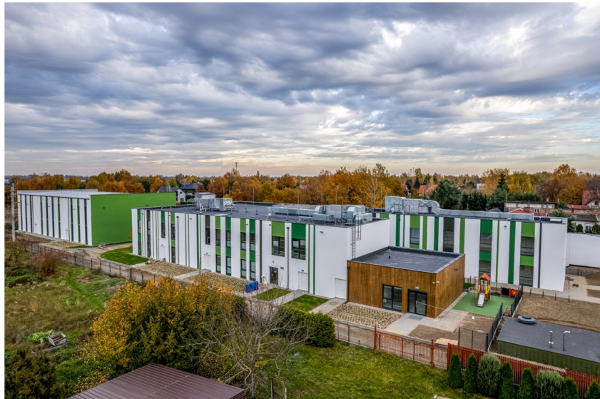
Fig. 7. Modular school in Łomianki

Modular school in Łomianki. A 2,800 m 2 , two-storey education building designed to house and accommodate 240 children at a time. This building, made of prefabricated wooden elements, was erected in 2021.