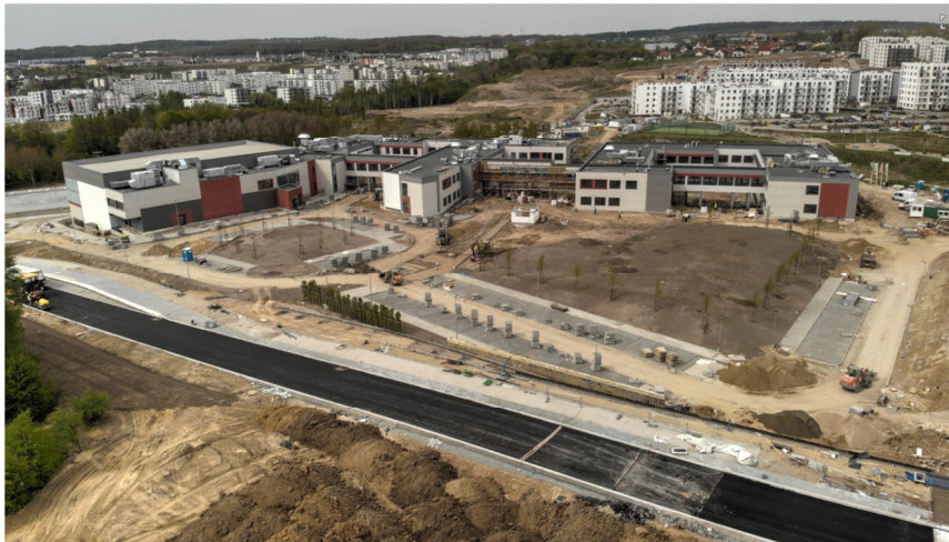
Fig. 8. Jabłoniowa Education Centre

Jabłoniowa Education Centre. The state-of-the-art modular school and kindergarten is the largest prefabricated timber frame technology-built educational complex in Central and Eastern Europe. It covers an area of nearly 10,000 m 2 , the first part of which is a primary school capable of accommodating 800 pupils, while the second segment of the complex is a kindergarten designed for 200 children. The construction of the energy-efficient complex took 1.5 years from the breaking of the first shovel to the completion of the complex, which would not have been possible with a traditional construction method for such a large investment. The construction of the building is based on box-type ceilings, a technique which is characterised by its fire resistance, as in the event of fire the elements retain their load-bearing capacity, airtightness and fire insulation for up to 60 minutes.