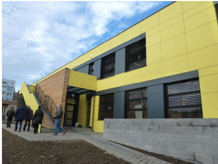
Fig. 5. Kindergarten in Prague

The need to build new educational investments is variable in proportion to the current demographic structure of the country. There is also a noticeable lack of adequate educational infrastructure especially in smaller municipalities, and meeting expectations and needs often depends on the budget of the administrative unit, which is often not sufficiently funded. An example of rapid response to community needs can be seen in a kindergarten in the Czech city of Prague. The existing old building no longer met the standards for children's accommodation and had to be demolished. It was necessary to act quickly because the users were left without help and kindergarten. It was therefore decided to build a modular building with an area of 982 m 2 . The whole project took four months to complete.