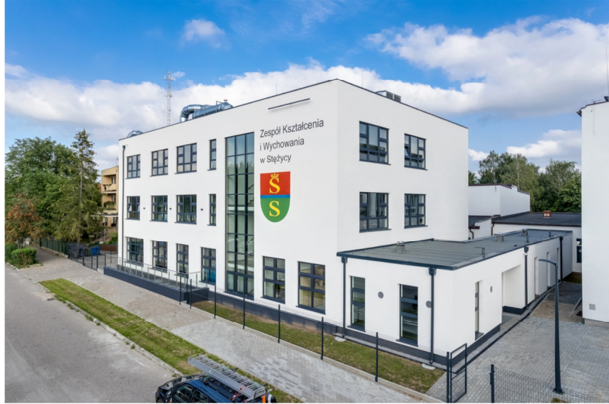
Fig. 6. Modular school in Stężycza.

Modular school in Łomianki. A 2,800 m 2 , two-storey education building designed to house and accommodate 240 children at a time. This building, made of prefabricated wooden elements, was erected in 2021.