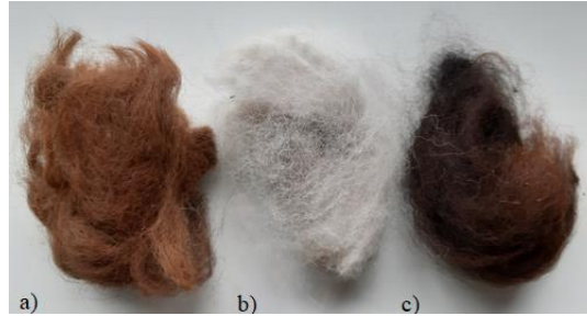
Fig. 2. Alpaca wool: a) red, b) light, c) brown