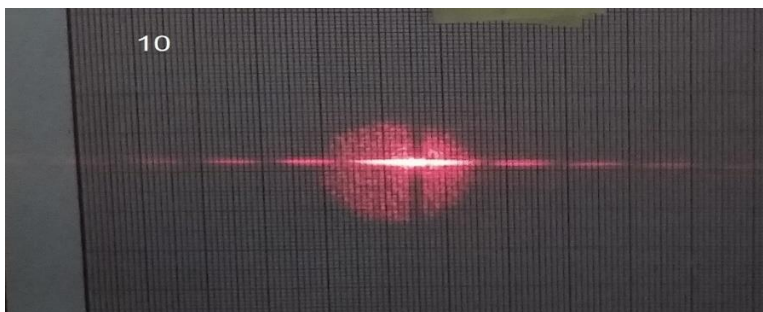
Fig. 4. Distribution of diffraction fringes for light hair