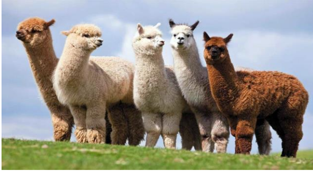
Fig. 1. Alpaca